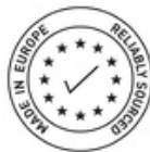
MADE IN EUROPE