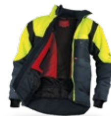
Use with X29J jacket