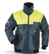
Use with X12J jacket